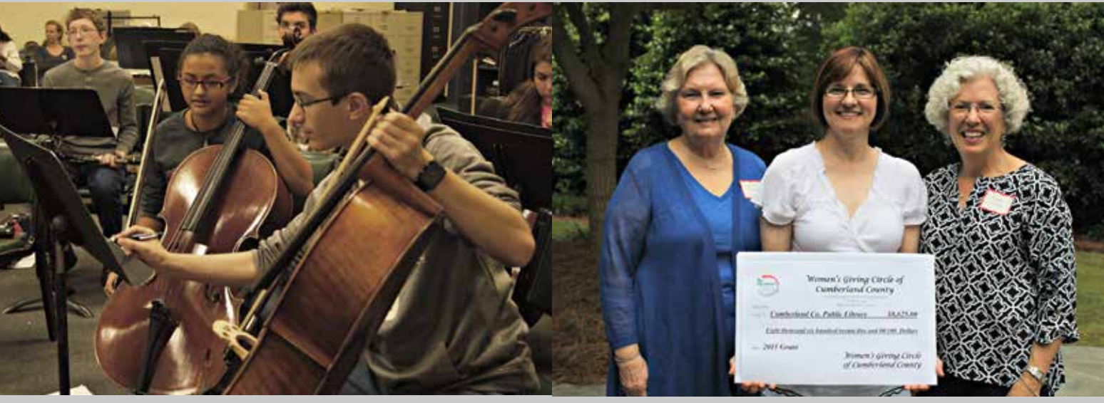
CCF provided start-up funding for the Fayetteville Symphony Youth Orchestra